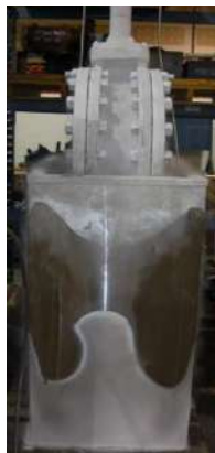
18 CL150 DF CF8M Cryogenic NASA Test