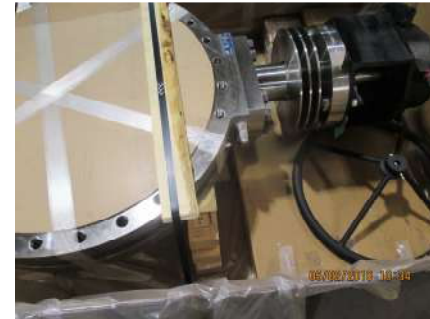
30 CL150 Lug CF8H High Temp Heat Ext Sulfuric Acid Service