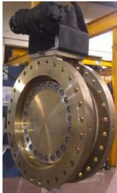
30 CL150 DF Short NiAlBz x Monel Trim Seawater Service