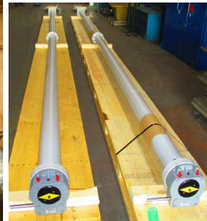
2 CL150 Lug WCB 36 Foot Gear Extension