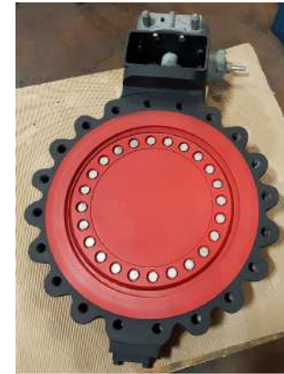
24 CL150 Lug WCB IPC System 3 Red