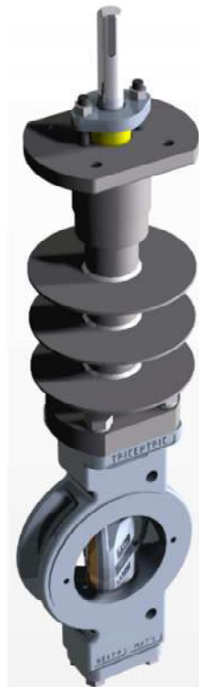
3 CL150 Wafer High Temp Heat Extension