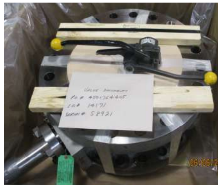
16 CL900x600 DF Short CF8M Fertilizer Production Application