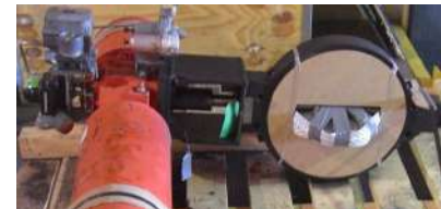
16x14 CL150 Wafer WCB Steam Jacket Body & Traced Shaft Fail Open