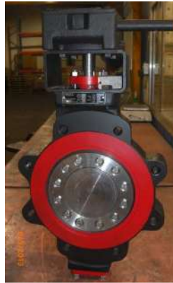
8 CL150 Lug WCB IPC System 3 Red x CF8M