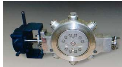
8 CL150 Wafer Nickel 200 CZ100 with Intergral Steam Jacket Caustic Soda Application