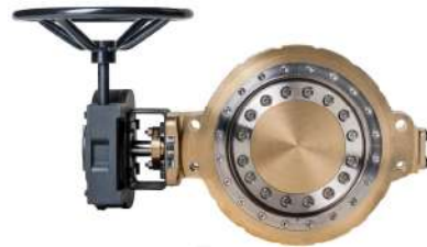
16 CL150 Wafer NiAlBz x Monel Replaceable Seat Recycle Cooling Water Service