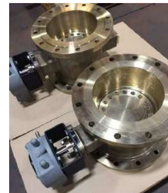
12 CL50 DF Gate NiAlBr Recycle Cooling Water Service