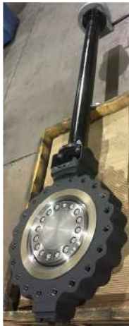
16 CL300 Lug WCB Gear Extension