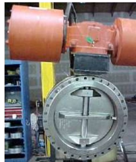
36 CL150 DF Special WCB Nickel Plated