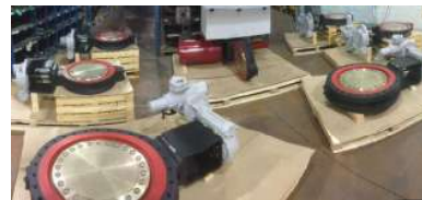
24 Wafer and 30 Lug CL150 WCB w/ Impreglon Coating x NiAlBz Trim Recycle Water