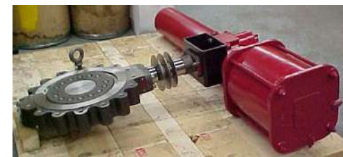
18 CL150 Lug CF8MH High Temp Heat Extension Steel Mill Application