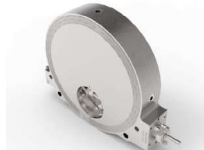
24x8 CL150 Wafer WCB Flow Control Application