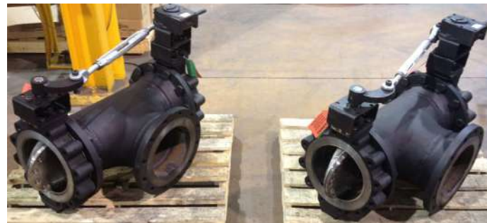
10 CL150 Lug WCB 3 Way Linkage Tee Assembly