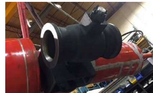
10 CL1500 WCB Clamp End Valve Refinery Compressor Application