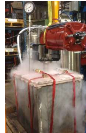
8 CL300 Lug CF8M Cryogenic Blue Origin Test