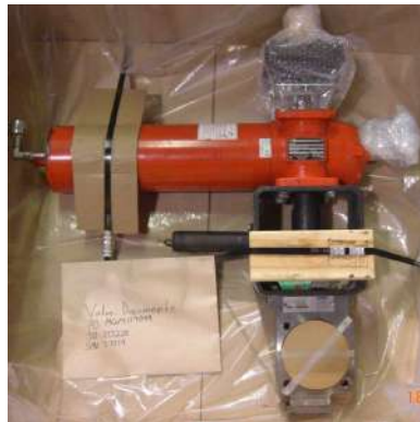
3 CL150 Lug Titanium Gr2 x Gr 5 Pulp Mill Application