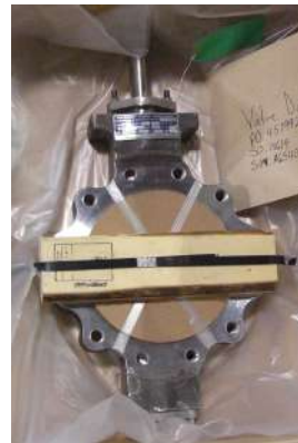
6 CL300 Lug Inc 625 CW6MC