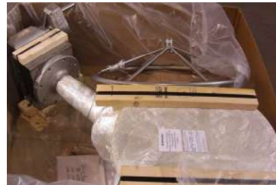
8 & 18 CL150 DF Gate CF3M Cryogenic NASA LOX Shutoff