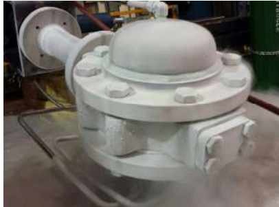
8 CL300 Cryogenic Test Blue Origin Launch Pad Application