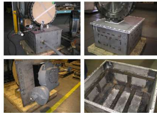
30 CL150 DF Short CF8M Submersible Actuator Enclosure