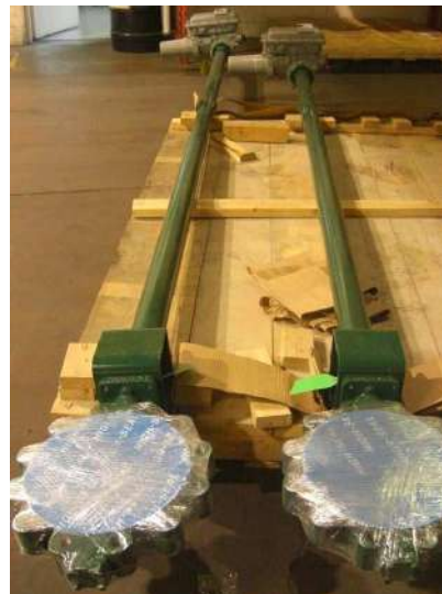
12 CL150 Lug WCB Highseal MOV 1 Actuator Extension