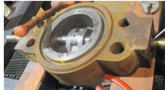
6 CL1500 x 300 RTJ Wafer WCB Control Application at Maintenance