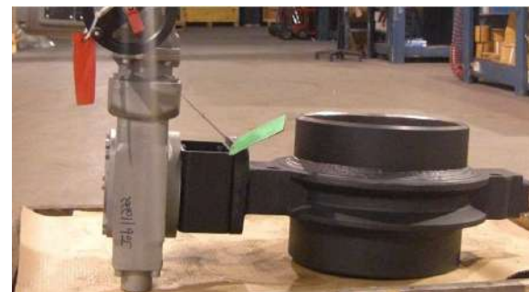
18 CL50 Butt Weld End WCB Fabricated Steam Service