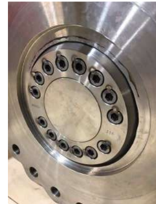
12 CL600 Lug CF8M x Stellite 21 High Vibration Flow Control Application