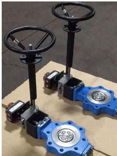
4 CL300 Lug WCB Handwheel Extension