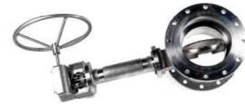
12 CL150 DF Gate CF3M Cryogenic NASA LOX Shutoff