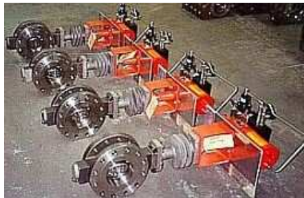
8 CL300 DF Short CF8MH High Temp Heat Ext Heat Shield Actuated