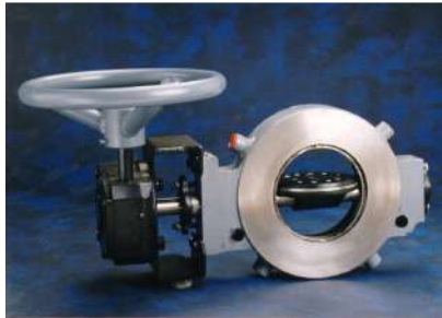
6x4 CL150 Wafer WCB Steam Jacket Body