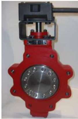
8 CL150 Lug WCB Impreglon 222M Coating x CF8M