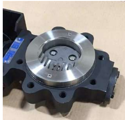
4 CL150 Lug WCB Flow Control Cartridge Application