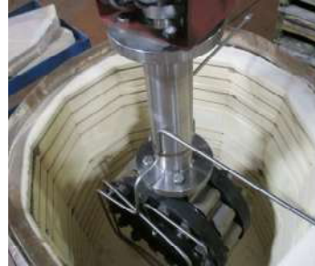
10 CL300 Lug CF8M High Temp Performance Pretest-2