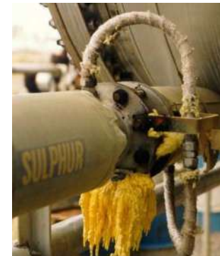
Sulfur Leakage at Flanges Without a Reduced Port Valve