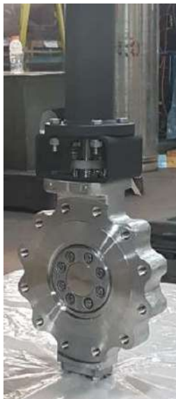
6 CL600 Lug CF8M Actuator Extension