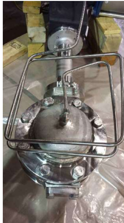
8 CL300 Lug CF8M Cryo Test Flange Setup