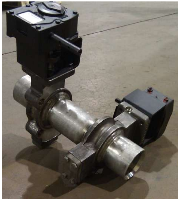
3 CL300 Butt Weld End Double Block Offset Steam Service