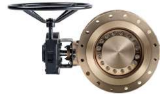
16 CL150 DF Short NiAlBr Seawater Service