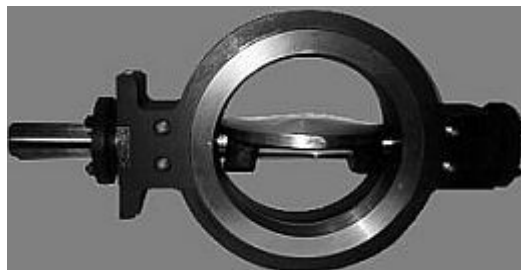
20 CL600 Wafer WCB Special Minimum Flow Control Disc Orifice