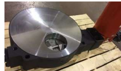
24x8 CL150 Wafer WCB Flow Control Application