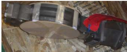
6 CL150 Wafer CF8M x Inc625 High Temperature Lockheed Martin Engine Test Stand