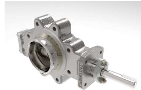
4 CL150 Butt Weld End CF8M Fabricated