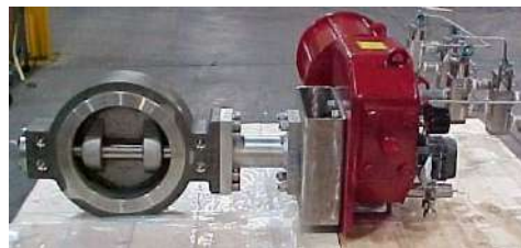
16 CL600 Wafer High Temperature Heat Extension