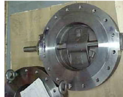
18 CL150 Lug Titanium Grade 2 Sulfuric Acid Service Mine Application