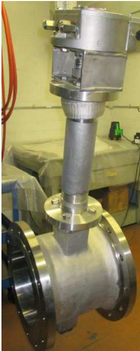
8 CL150 DF Gate CF3M Cryogenic NASA LOX Application