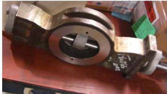
4 CL600x300 Wafer CF8M Natural Gas Shut Off Application