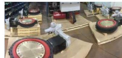
24 Wafer and 30 Lug CL150 WCB with Impreglon Coating x NiAlBz Trim Recycle Water