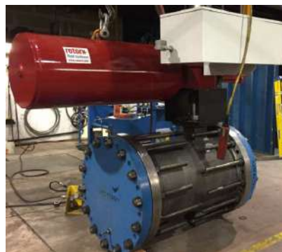
30 CL300 DF Gate WCB Electro Hydraulic Test Actuator Pressure and Cycle