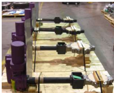
8 CL150 Lug CF8M Fire Isolation Extension Heat Shield & KMASS Actuator