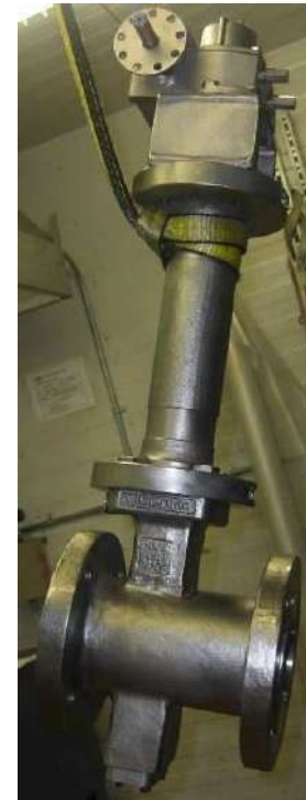
3 CL150 DF Gate CF3M Cryogenic NASA LOX Shutoff