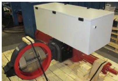
24 CL150 Wafer WCB Impreglon System 3 Red Coating x NiAlBz Electrohydraulic Act