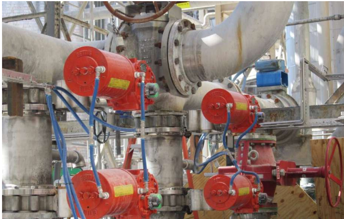
Triscentric white liquor lime mud pump isolation