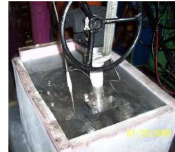
12 CL150 DF CF8M Cryogenic NASA Testing