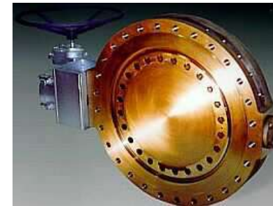
30 CL150 Lug NiAlBz Seawater Service