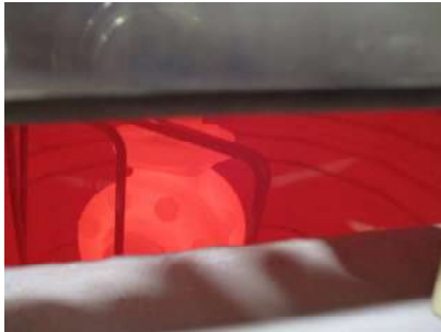
3 CL300 Lug CF8MH High Temperature Performance Test