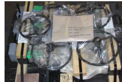
4 CL300 6 CL150 Wafer CF8M x Monel Gaseous Oxygen Service