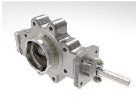
3 CL300 Cast Butt Weld End