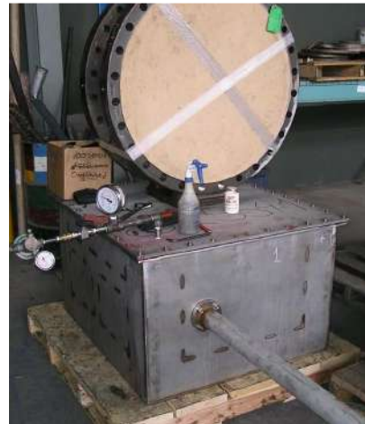
30 CL150 DF Short CF8M Submersible Test Actuator Enclosure Pressure