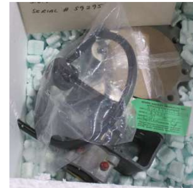
4 CL150 Lug Hast C CW2M SO2 Prescrub Water Carbon Capture Clean Coal