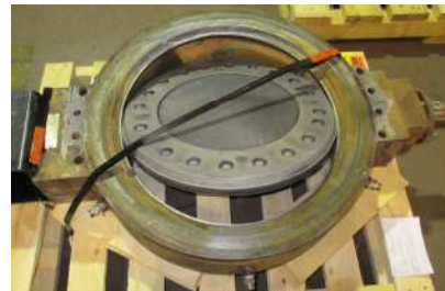
26x24 CL150 API Wafer WCB Steam Jacket & Traced Shaft in for Maintenance