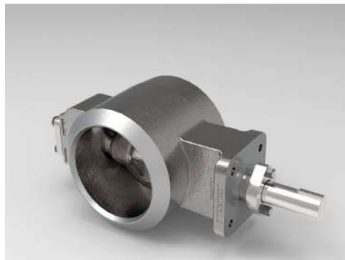
3 CL300 Cast Butt Weld End