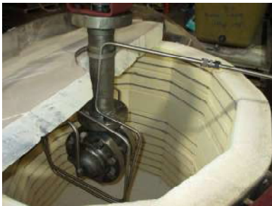
3 CL300 Lug CF8M High Temp Performance Pretest-1