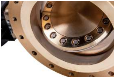
16 CL150 DF Short B148 C95500 NiAlBr Seawater Application