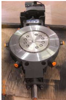
10x8 CL150 Wafer WCB Steam Jacket Body & Shaft Tracing