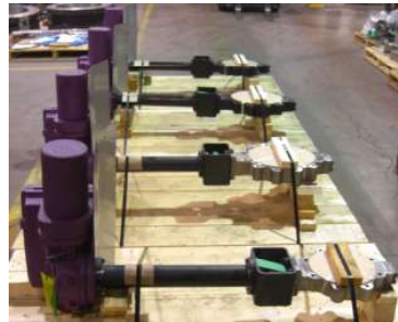
8 CL150 Lug CF8M Fire Isolation Valves Extension Heat Shield & KMASS Actuator