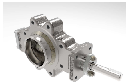
4 CL150 CF8M Fabricated Butt Weld End