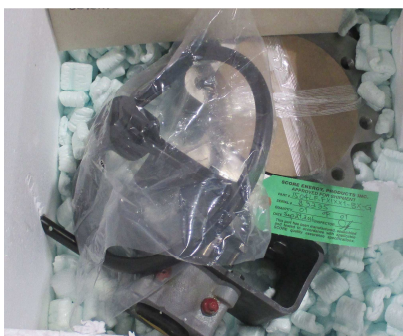
4 CL150 Hast C Lug SO2 Prescrub Water Carbon Capture Clean Coal Project