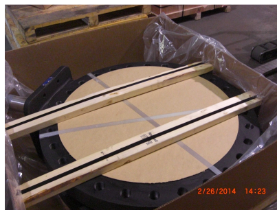
28 CL300 Lug WCB Steam Application China