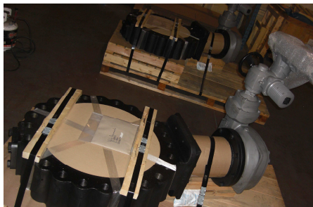
24 C600 Lug WCBxCF8MxStellite Fuel Gas Shutoff with MOV Application