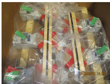
8 CL150 WCB Westinghouse Nuclear Cooling Water 120 Valve Shipment