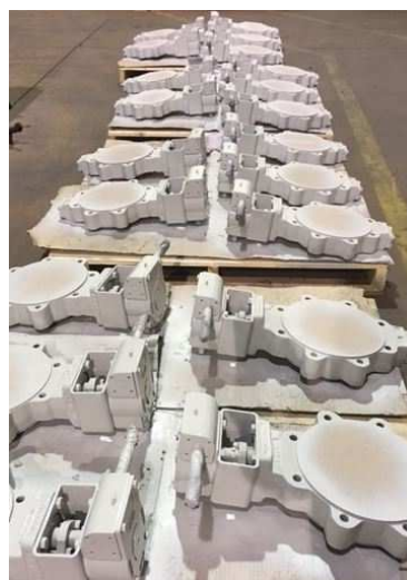
8 CL150 WCB x Specialty Coating Westinghouse Nuclear Project