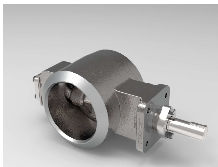
3 CL300 Cast Butt Weld End