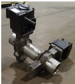
3 CL300 316 SST Fabricated Double Block Offset Butt Weld